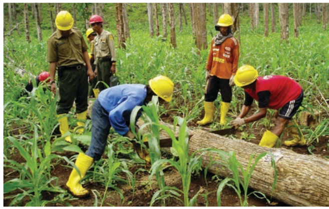
Cutting a tree in Indonesia