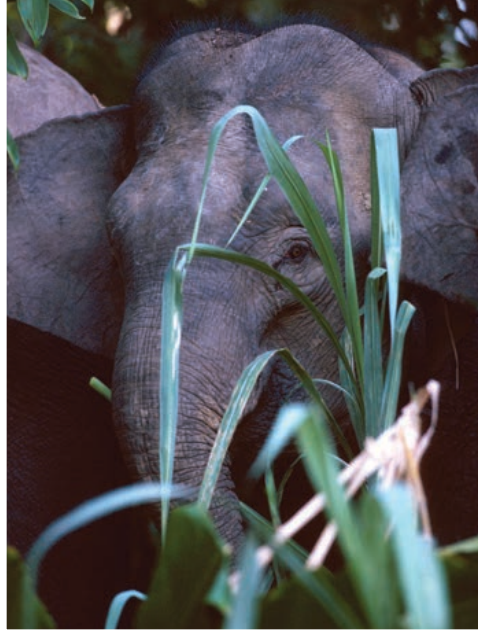
Bornean pygmy elephant