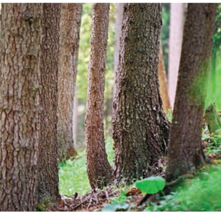
FSC-certified forest in Switzerland