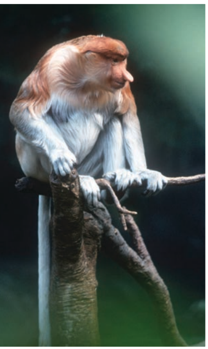
Proboscis monkey in Indonesia