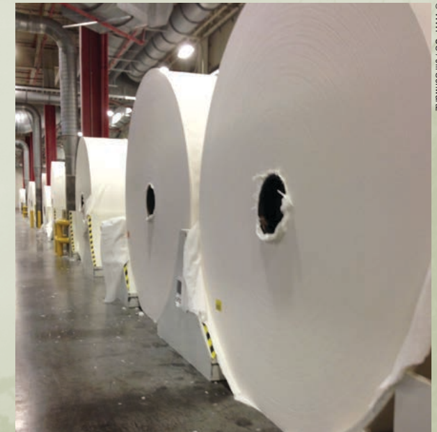
FSC-certified pulp is used to make toilet paper at a Kimberly-Clark facility in South Carolina.

GFTN-NA participants are also active on the policy front. Most are advocates for the Lacey Act, created in 1900 and amended in 2008 to include the prohibition of illegal timber and timber products from entering the US market. GFTN-NA participants are working with WWF to ensure full implementation of the 2008 amendments. The amendments are inspiring companies to make smarter sourcing decisions and monitor their global timber supply chains to avoid any illegal timber.