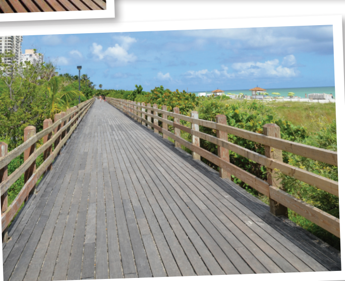
From top left counterclockwise: Columbus Circle (New York City, New York, USA), Miami Beach Boardwalk (Miami, Florida, USA), Treasure Island Casino (Las Vegas, Nevada, USA).