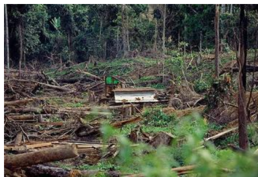
Illegal logging on Penan traditional land in Sarawak, Malaysia