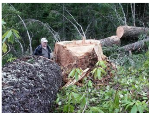
This logging on Oregon public land was found illegal by court ruling after trees were cut.

Illegal logging contributes to deforestation, biodiversity loss and greenhouse gas emissions, deprives nations of public revenue, and can lead to social conflict and human rights violations, the new Alliance said in a statement today.