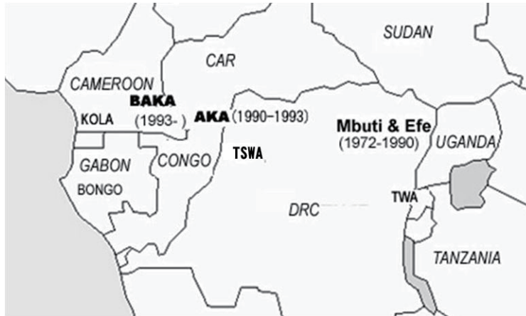
Fig. 1 Distribution of indigenous people (Pygmy hunter-gatherers) groups in central Africa and years of research (in parentheses) by Kyoto University group.

The conservation of tropical rainforests is now an issue throughout the world, the emphasis often being laid on the fact that it is a “global” problem. The destruction of tropical rainforests is linked to the disappearance of biological diversity, including rare and endangered species, and of the gene pool. It also causes global warming by increasing the carbon dioxide in the atmosphere. These are issues for all human beings that must be addressed on a global scale. Based on this awareness, a lot of financial and human resources have been input into this problem, and research on tropical rainforests as well as conservation activities are taking place throughout the world. Activities related to tropical rainforests are now developing under a global network with the involvement of a wide range of fields such as politics and economics, scientific research, education and publicity, as well as actual conservation activities.