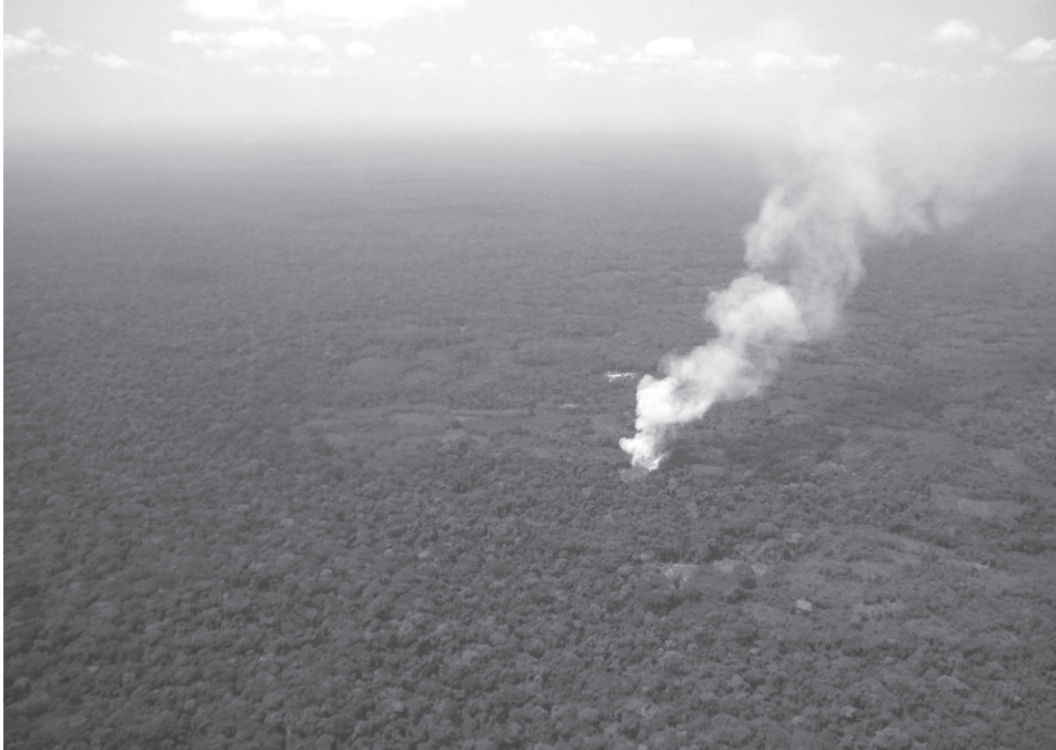
Fig. 4. An aerial view of the Congo Basin forest.

formed small-scale dispersed villages in the forest. They sometimes formed an association of several neighboring villages, but never formed larger polities until recently (Vansina, 1990). Rather, when the villages became too large, they simply split into smaller units and moved further into the interior forest. In this way, they have left a mosaic vegetation, composed of village sites, fields, secondary forests of various succession stages, and mature forests, as we see in the Fig. 4.