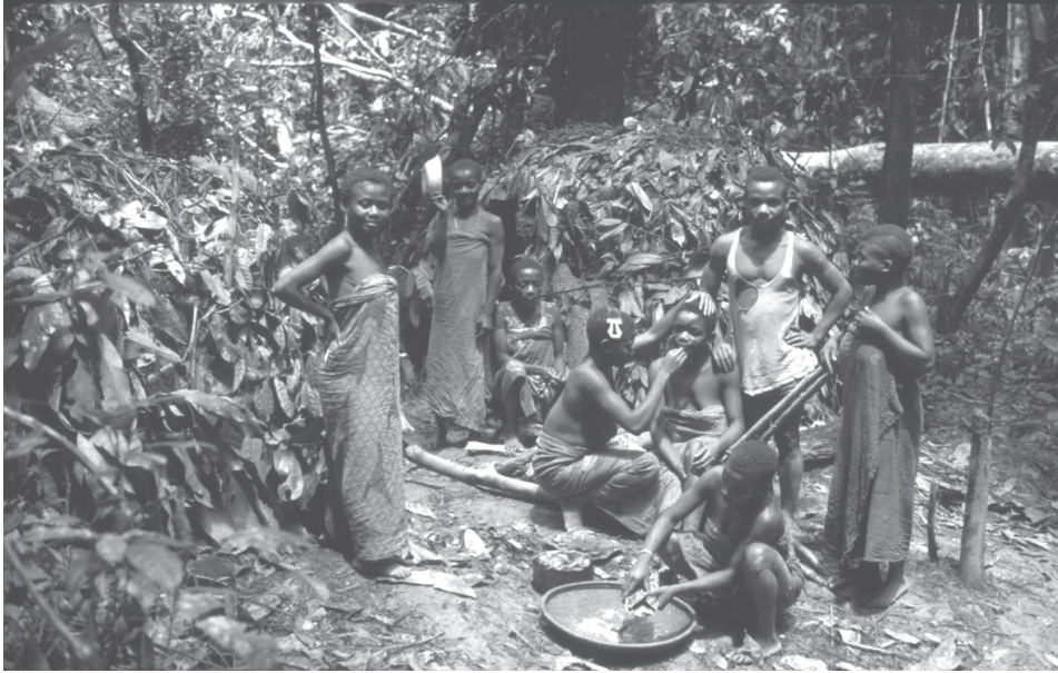
Fig. 2. Forest culture: A diversity of plant materials are used in a camp of Mbuti hunter-gatherers.

cultural and historical relationship between the inhabitants and the forests had only drawn the attention of some anthropologists.